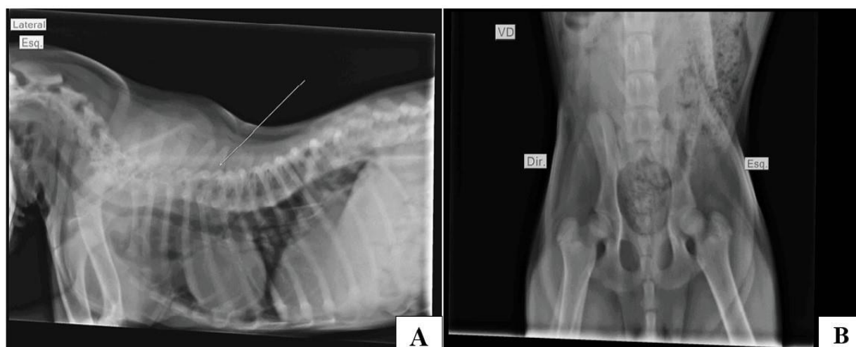
Figure 1. Radiographs of the vertebral and pelvic region of the animal referred to in this case. (A) Left lateral view of the spine with visualization of cervical and thoracic vertebral structures and a part of the lumbar region. The presence of kyphosis and possible narrowing of the vertebral bodies are observed. Note at the arrowhead, a vertebral structure of inconclusive aspect in the thoracic region, close to the intervals between vertebrae T4 to T10 (arrowhead). (B) Ventrodorsal projection (VD) of the pelvic region with visualization of bone structures within the common radiographic pattern, with deep and smooth acetabulum, as well as a round and well-coupled femoral head to the acetabulum. It is noteworthy that the patient's misaligned position during the exam may suggest false diagnoses.

As a way to exclude possible fractures, hip dysplasia and to complement the diagnosis, it was recommended to perform a new radiograph that would allow the vertebral and pelvic assessment, which was done in the clinic of the service (Figure 1). Through the latero-lateral spinal radiography, the presence of possible alterations in the thoracic portion was noted, however inconclusively. Through the analysis of the ventrodorsal radiograph of the pelvic region, the hypothesis of occurrence of hip dysplasia suspected by the first professional was discarded, due to the presence of deep and smooth acetabulum, round femoral head and well coupled to the acetabulum (Figure 1).