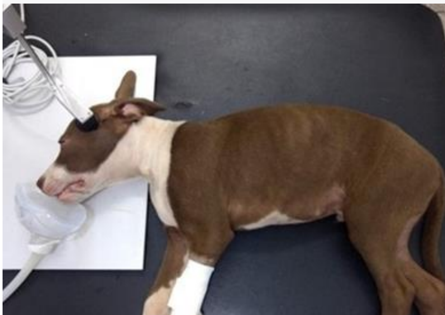
Figure 1. A dog with TBI underwent non-invasive monitoring of intracranial pressure (ICP-Ni) using the Brain4care ® monitor. The patient was positioned in right lateral recumbency, and the sensor was placed on the parietal region with the assistance of the Brain4care ® stereotactic apparatus.

Two veterinarians were responsible for patient management. The dogs were brought into a room and positioned in lateral recumbency on a table, with the stereotactic apparatus base in place. Subsequently, the environment was kept quiet, with cotton placed inside the auditory canals to manage noise, and eye coverage with a dressing was applied as needed to reduce visual stimuli, for each case. Once the patients became relaxed and still, the sensor was positioned on the parietal skin without the need for shaving, aligning with methods outlined in another study (2) and ICP-Ni recording commenced (Figure 1). In cases where initial monitoring was disrupted by head movement or agitation, sedatives were administered, enabling successful monitoring sessions. The durations of ICP-Ni recording varied from 2–5 min.