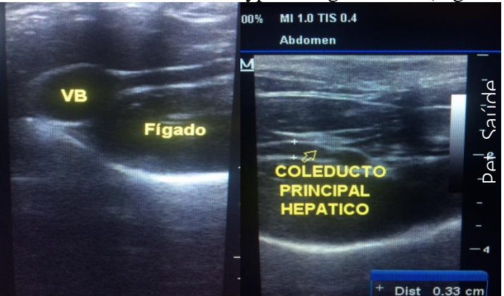
Figure 1. Hepatic area with repletion and dilation of the gall bladder and main choledochal duct and hyperechogenicity of the wall.

anechoic content, with sediment, thickening and hyperechogenicity of the wall; and main choledochal duct was dilated with thickened and hyperechogenic wall (Figure 1).