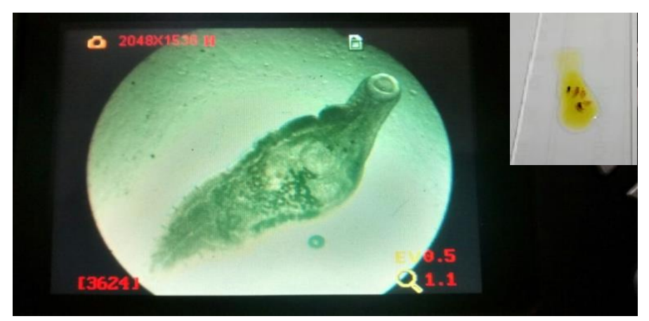
Figure 3. Macroscopic (high to the right) and microscopic aspect of Platynosomun sp. isolated in the bile (Obj. 40).

The patient's clinical picture has already been reported in animals affected by infestation by Platynosomum sp. (3,5,7,8). The jaundice is due to the impediment of the bile flow to the duodenum due to the obstruction caused by the presence of the parasite (7). The presence of icteric organs has also been reported (9).